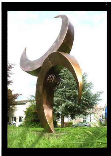
“Tumbler” Kingswood Foundation, Bristol 2007