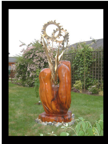
“Yew” Chippenham Hospital 2005

WOOD In 1982 he developed carpentry skills and was employed by Swindon Borough Council as a professional carpenter